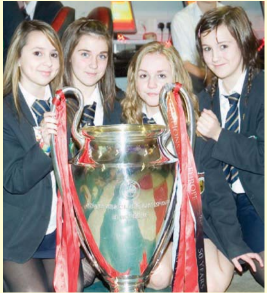
Year 8 with the European Cup!

Continuing with the football theme, sixth form business studies and economics students have visited Blackburn Rovers FC on a study day to examine the business world of football.