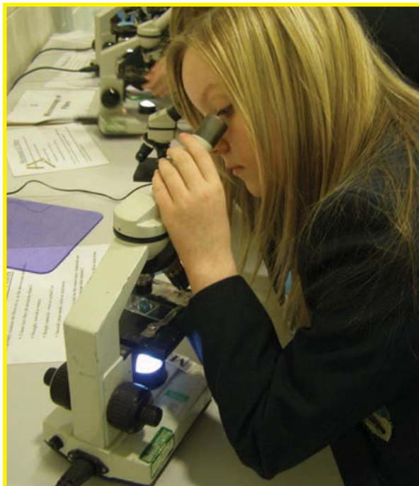
Year 8 student examines the evidence

The students witnessed a reconstruction of a murder and used chromatography; DNA analysis; finger print identification; blood typing; microscopic fibre analysis; and pH soil testing to narrow down the suspects and to build a case for the prosecution. Once the pupils had collected their evidence, they questioned the suspects and made their accusations.