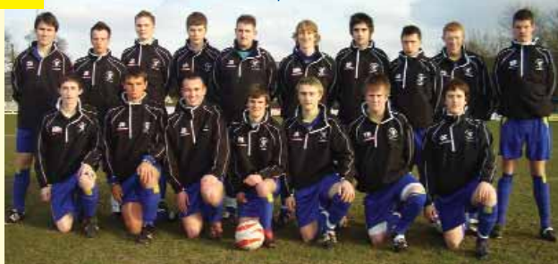
Lancashire U19 football champions