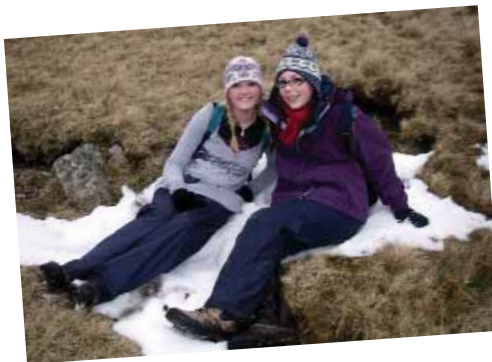
Students enjoying the snow at Longsleddale.

It needs to raise £20,000 to re-roof the main building and to install a new kitchen.