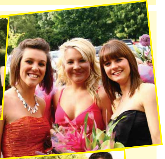
Year 13 Leavers' Ball