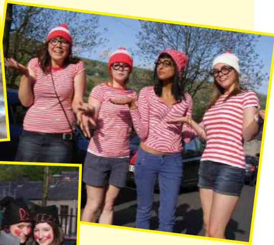
Fancy dress for Year 13