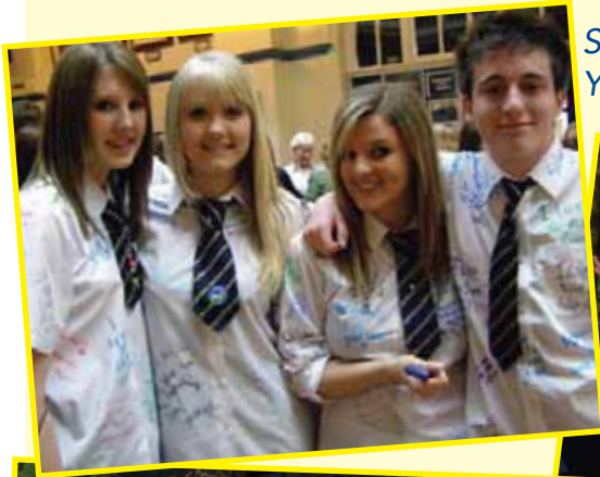
Shirt-signing for Year 11

Year 11 finished school in May with their annual shirt signing session and Year 13 were resplendent in diverse fancy dress costumes. We wish both year groups good luck for the future and would like to encourage all former students to keep in touch.