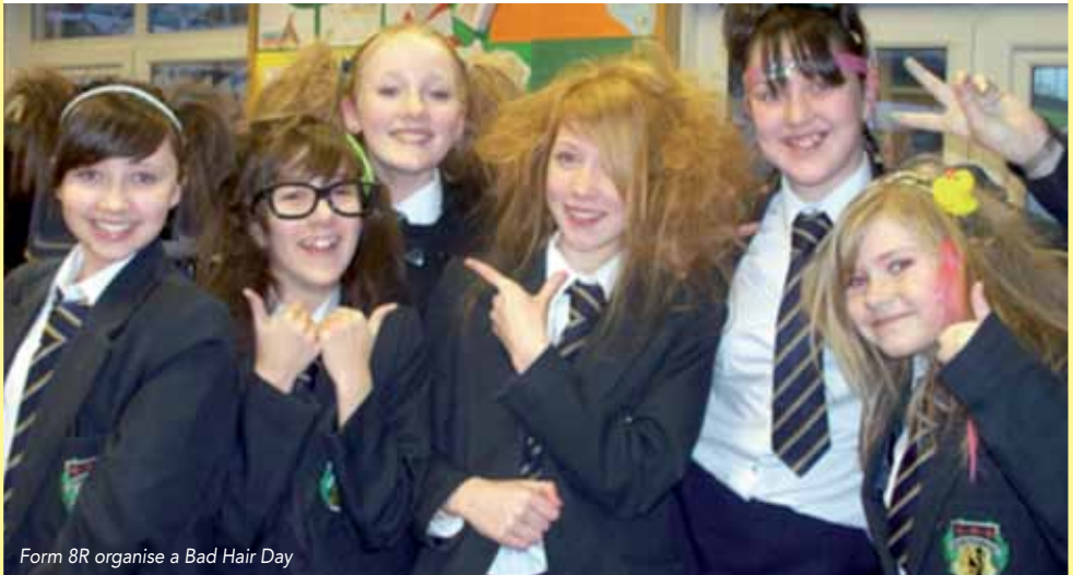
Form 8R organise a Bad Hair Day

The school as a whole has raised in excess of £2,000 towards UNICEF's Haiti Appeal.