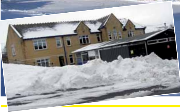
Preparing the school site after the snow