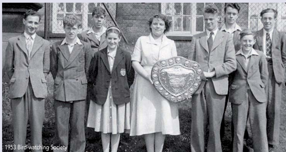
1953 Bird-watching Society

Here is a further photo from our BRGS archive. If you recognise anyone then please do get in touch.