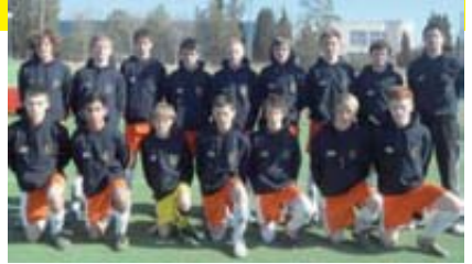
YEAR 11 TEAM