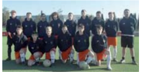
YEAR 10 TEAM