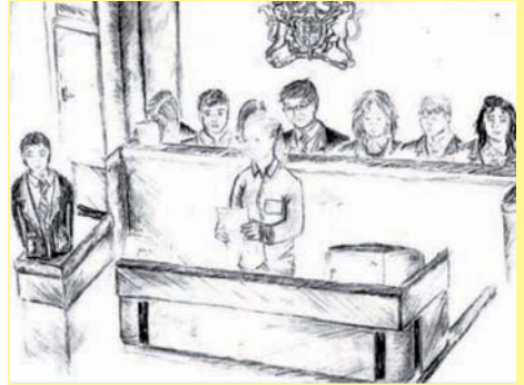
The drawing is by student, Sophia Flanagan.

All the students put in an excellent performance after weeks of practice and only missed out on winning the regionals by 2 points!